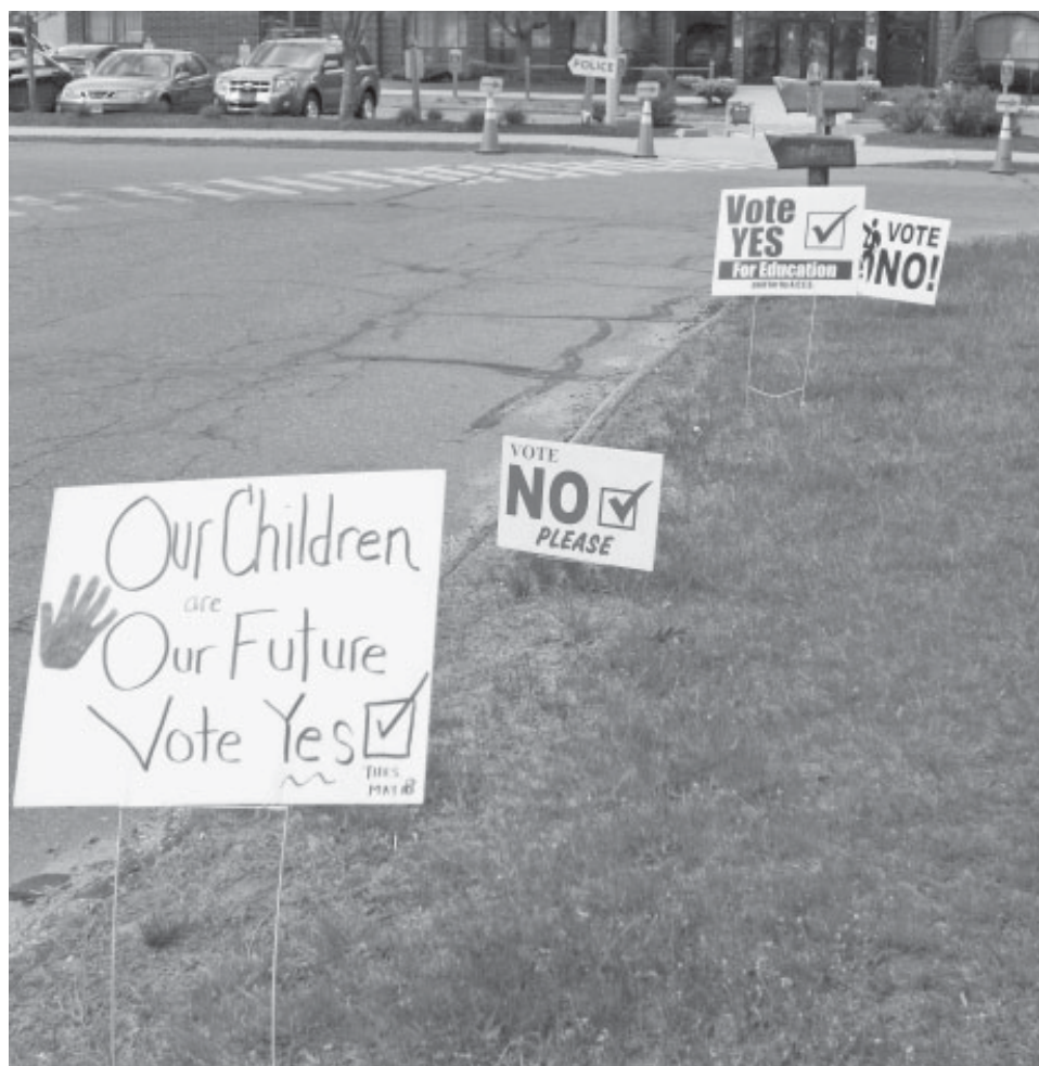
Who Won?.... Signs urging Colchester residents to vote for or against the town and school budgets lined the entrance of Town Hall this week. More than 2,000 voters turned out to weigh in on the proposed spending packages, which totaled $52.225 million. There were plenty of 'yeas' and plenty of 'nays.' To find out which side prevailed, turn to page 32.