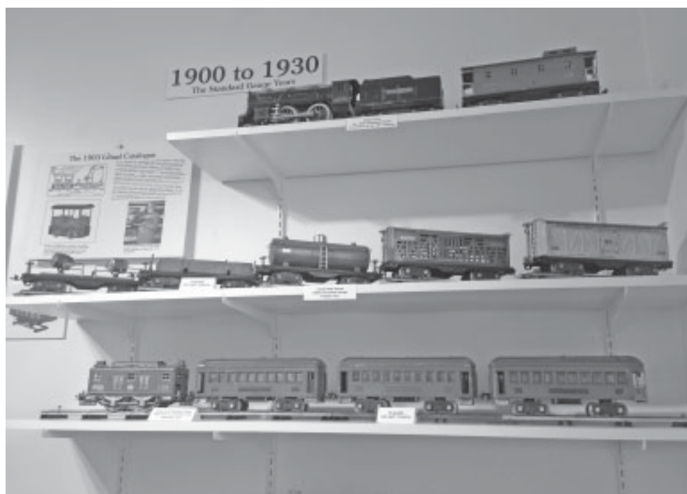
Toy trains from the early 1900s line the walls at the “On Track Toy Train Exhibit” that is currently on display at the Marlborough Arts Center. The exhibit gives visitors a taste of American history and culture, as it is full of collectible toy trains from the late-1800s up to the present day.

The exhibit at the arts center ends on Sun-